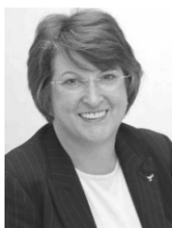
Catherine Bearder MEP