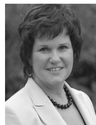
Sharon Bowles MEP